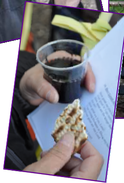
Church Without Walls celebrating Palm Sunday and Resurrection Day on the streets of NYC