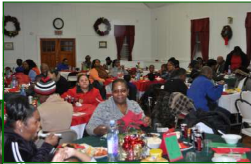
▼Families enjoyed the food and festivities.

►Hempstead Group enjoying a packed house in nearby Roosevelt, N.Y. ▼Seniors enjoying their appetizers in both Lower East Side and Long Island.