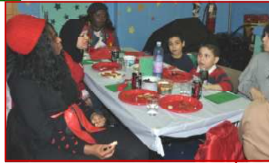
▼◀ At both

parties no one wanted to leave, including the kids! And to all a good night!