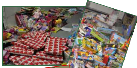
◀▶ Gifts, gifts, & more gifts for both NYC & Hempstead. ▼ Making spirits bright with the love of God!