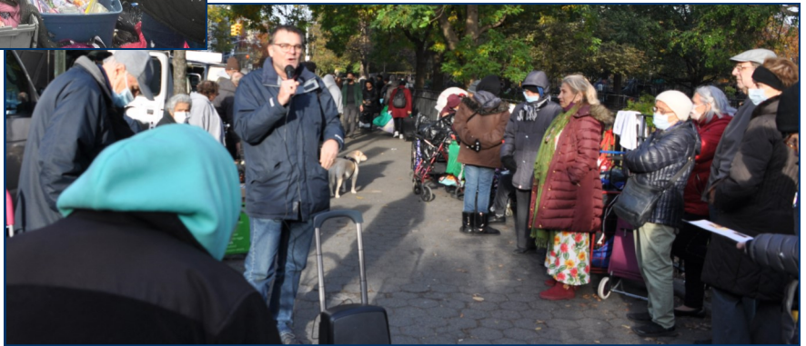
▼ New Outreach location in Brooklyn, NY. We ran out of food on our first trip there!