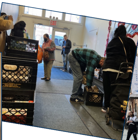
◀ ▲ V1 Church partnered with HFTF to form a great team to minister to the homeless and poor in their area. Please pray for this new outreach to bring in many souls.